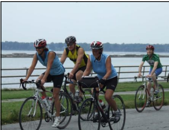
Left: CanAm 5 riders enjoyed the historical sights of downtown Buffalo.